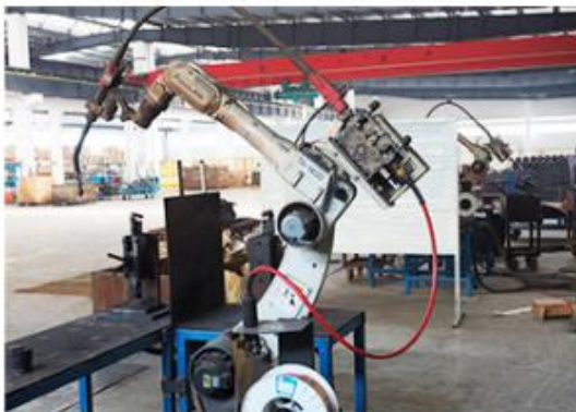
Welding Workshop ▲